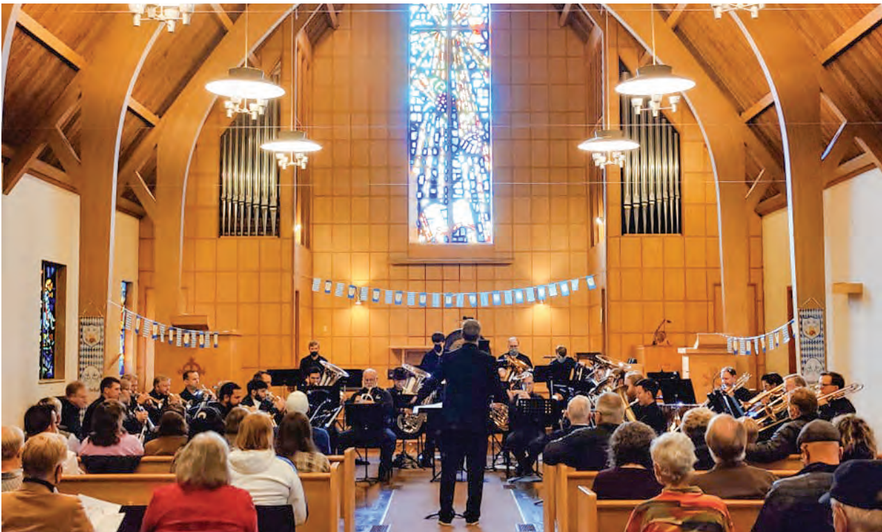
Puget Brass performing at Lutheran Church in October of this year.