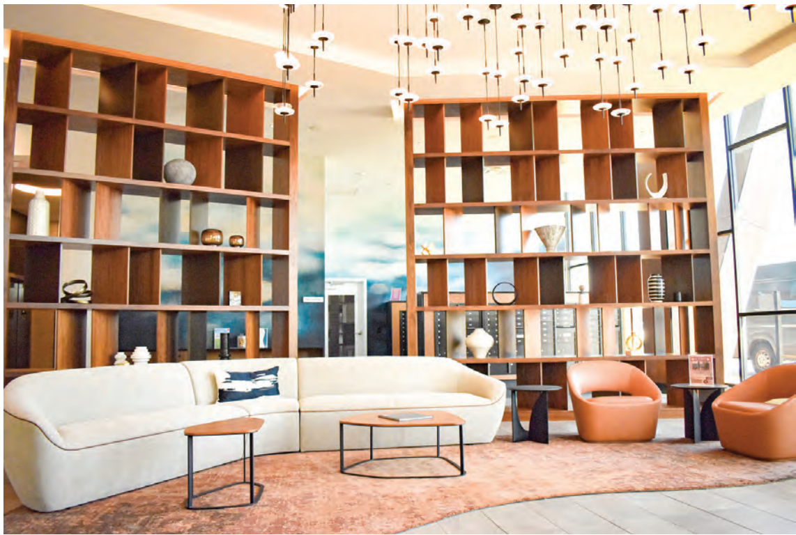
The main lobby of Alavon Alderwood Place.

According to the History Channel, the term "Black Friday," now synonymous with holiday shopping was first coined after the U.S. gold market crash on September 24, 1869. This Friday, November 25, thousands of shoppers are expected to take advantage of the many sales and deals in the stores of Alderwood Mall to begin securing their Christmas gifts for friends and family.