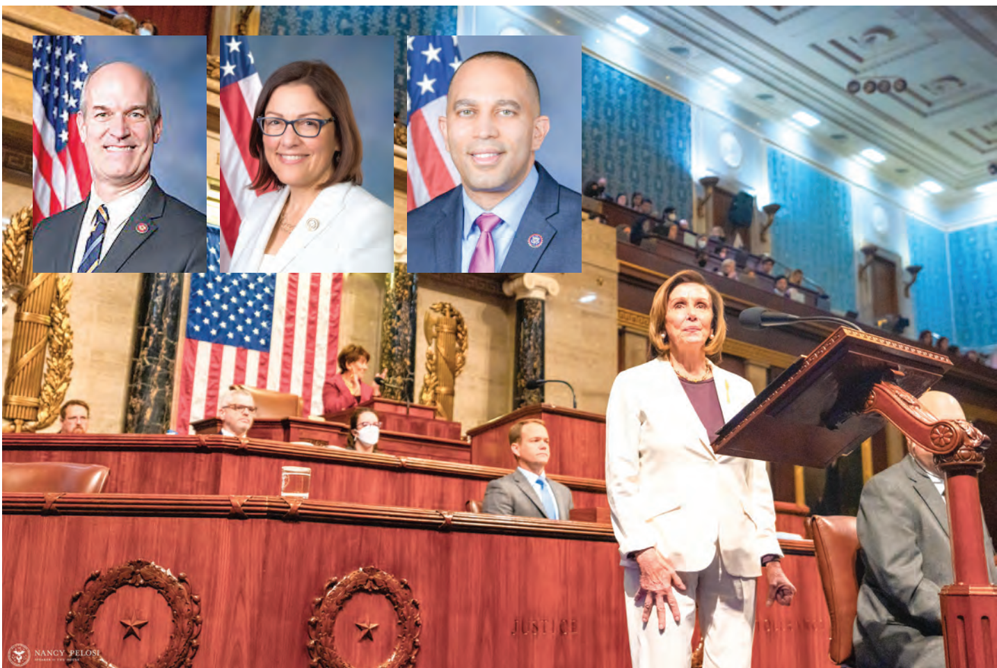
Rep. Nancy Pelosi (CA-12), 82, announcing her intent to step down as Speaker of the House on Nov. 17, 2022. Top: Rep. Rick Larsen (WA-02), Rep. Suzan DelBene (WA-01), and Rep. Hakeem Jeffries (NY-08).

“For two decades, Nancy Pelosi has been the heart of the House Democratic Caucus and fearlessly led us through some of the most challenging moments in our nation’s history, Rep. DelBene wrote. “I have watched in awe as she has stood up to enemies of democracy, both foreign and domestic. “Her career is historic in so many ways, including rising to be the first woman elected Speaker of the House, but she will be most remembered for the difference she made. This Congress she united a narrow majority to pass some of the boldest investments in our country’s future in decades and just led us through a history-defying election. No one has accomplished more in their time with the gavel than Speaker Pelosi. Her legacy will be felt for generations to come in this country and abroad.