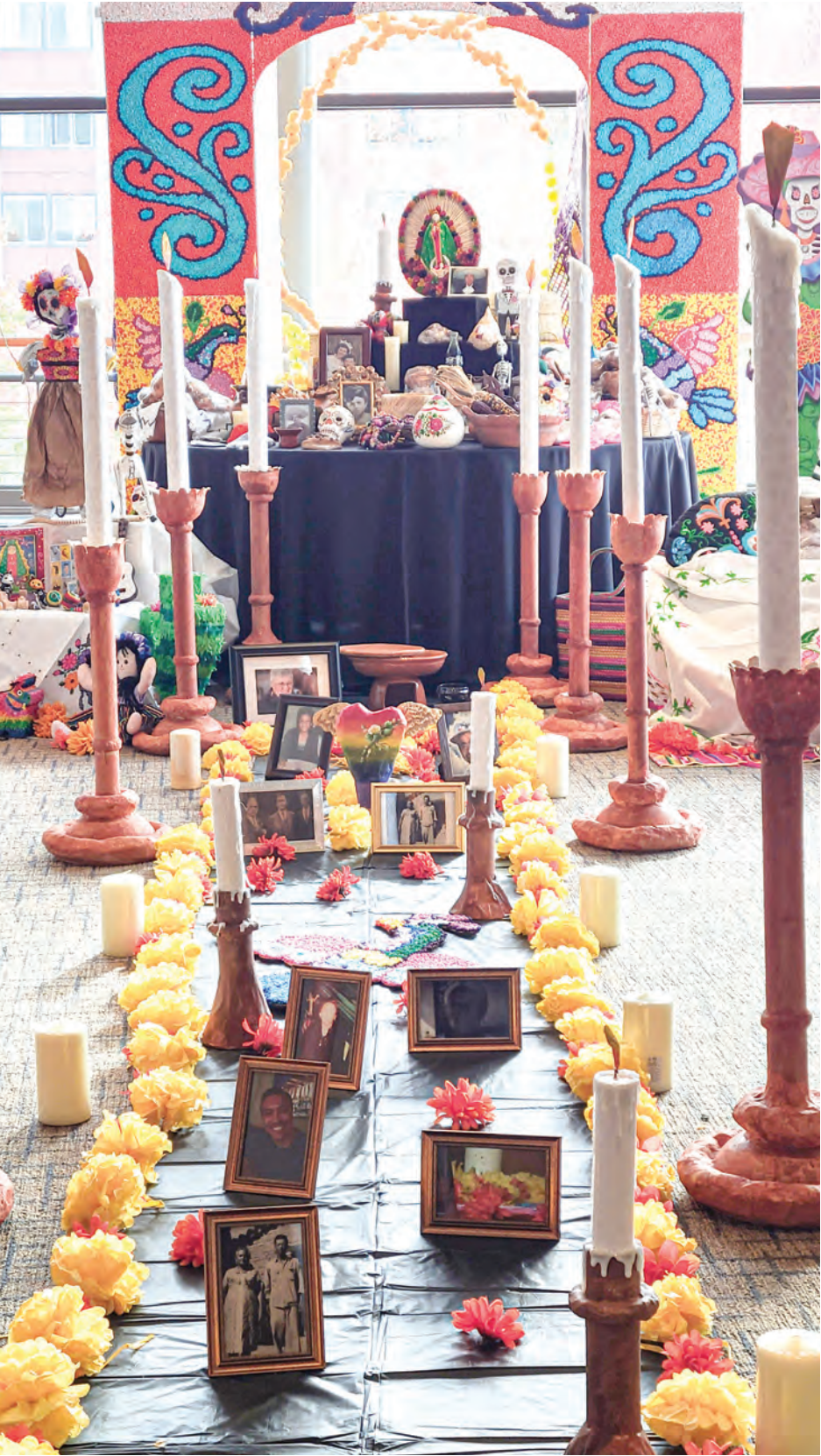
Alter to respect and remember those who have passed on at the Day of the Dead event at the Lynnwood Convention Center on October 29, 2022.

Of course, no celebration would be complete without delicious food. Volunteers dished out tamales and pan de muerto for the occasion.