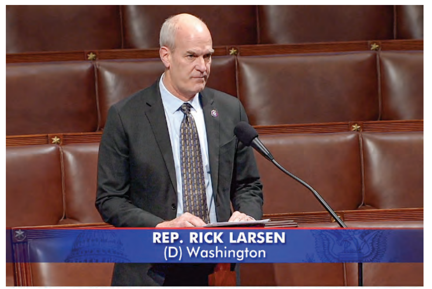
Congressman Rick Larsen (WA-02) addressing Congress on November 30, 2022, in favor of both the increase in pay and sick time for rail workers.