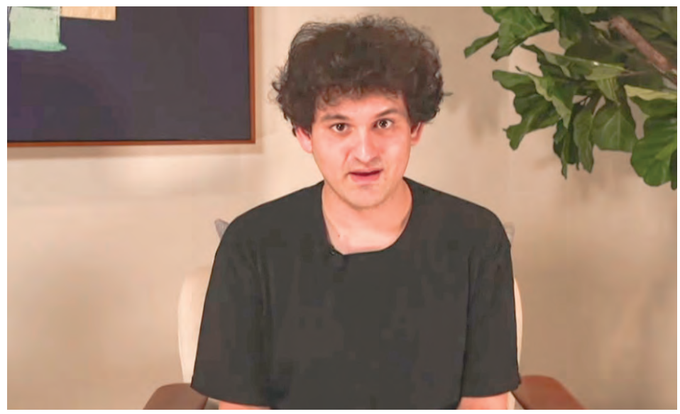
Sam Bankman-Fried, the founder of the collapsed crypto exchange FTX, speaks via a video feed from the Bahamas during at The New York Times' DealBook Summit 2022 on Wednesday, November 30, 2022, in New York.