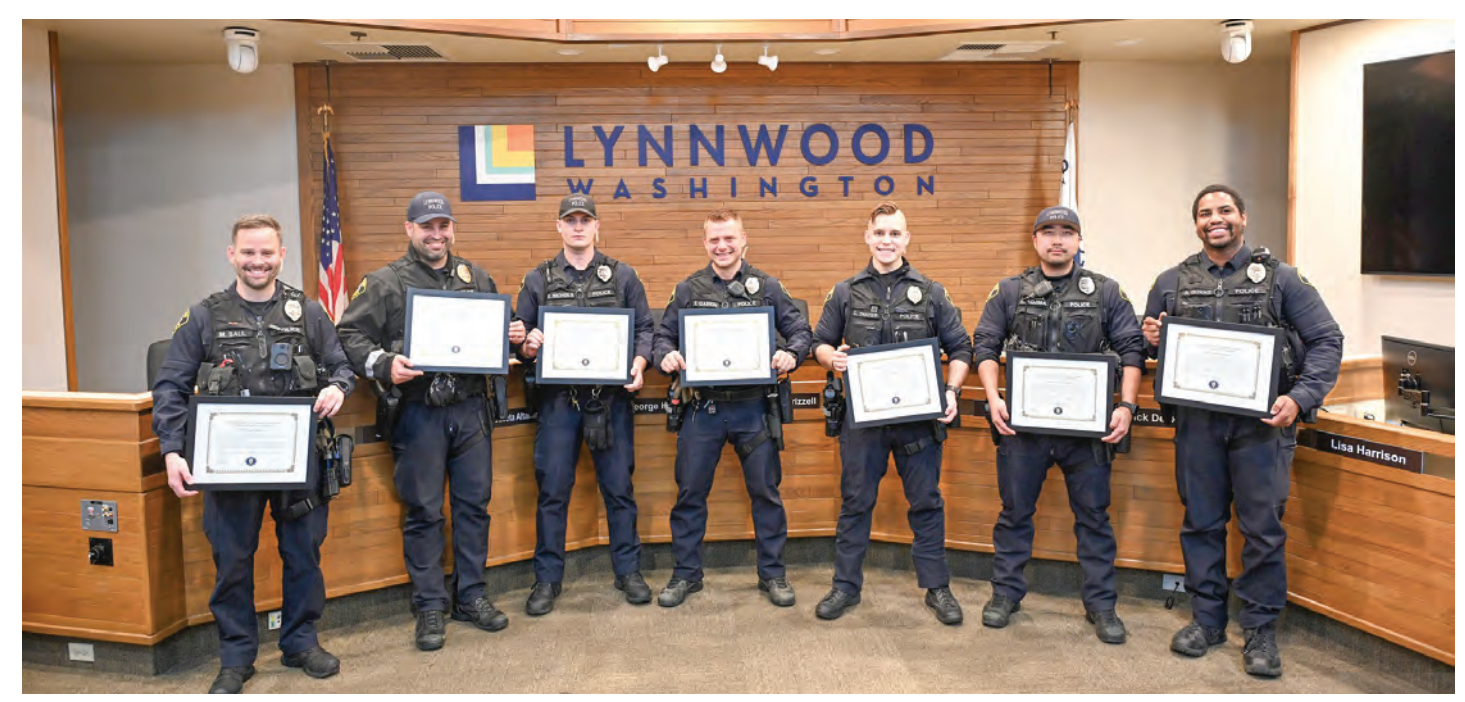
Seven of the 10 Lynnwood Police Officers who received a Letter of Commendation on November 1, 2022, for actions or performance above their normal duties.