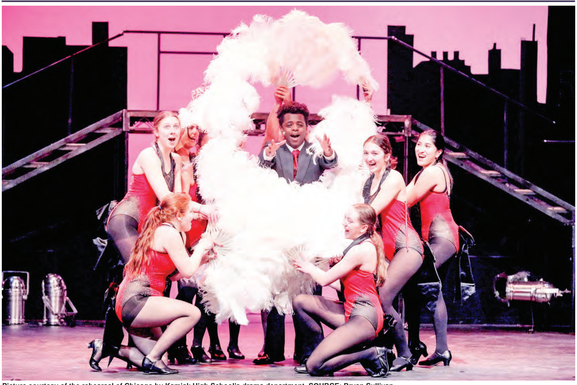
Picture courtesy of the rehearsal of Chicago by Kamiak High School's drama department.