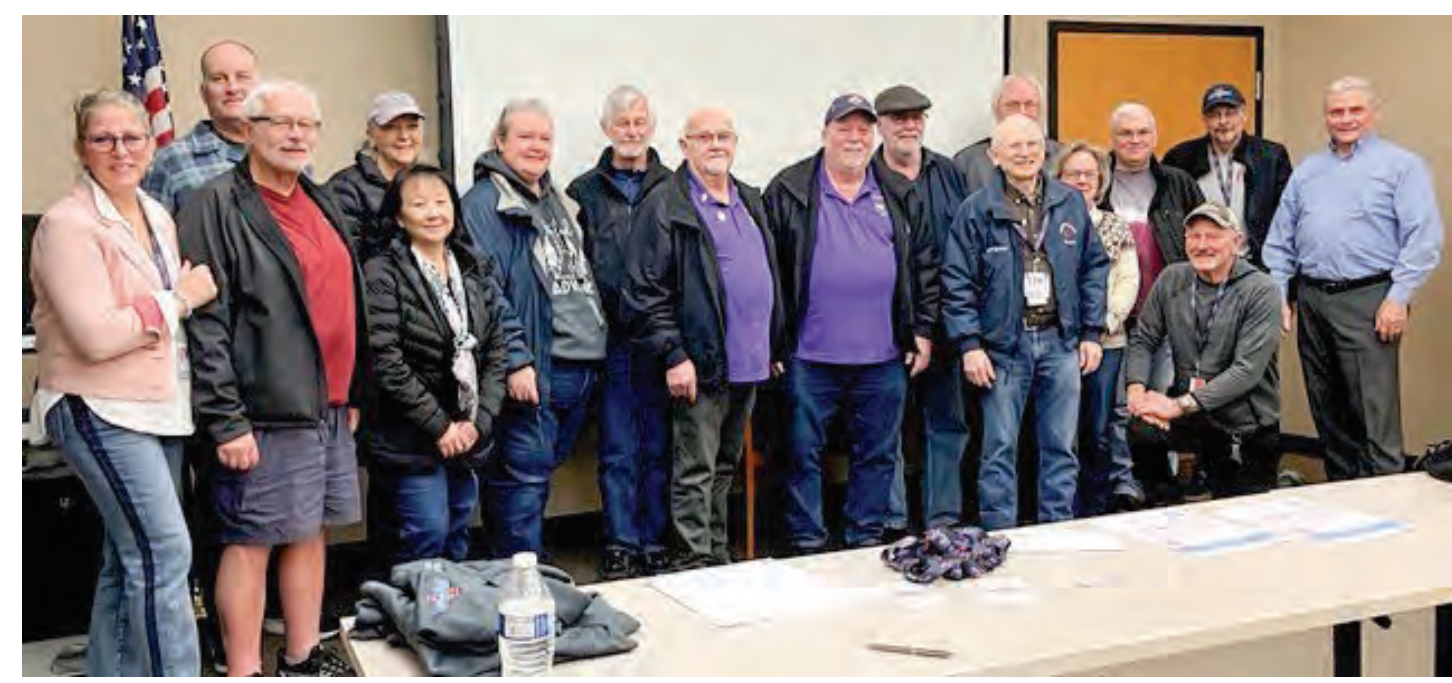
Some of the Support 7 Volunteers gather around three Elks' members as they recently came to a Support 7 Team training to donate a check to the 501c3 Non-Profit.

Support 7 is made up of specially trained volunteers who each year serve hundreds of local families in their darkest moments. This team responds alongside local police and fire first responders to local events such as fires, natural disasters, search and rescue operations, death by suicide, homicide and other crimes. They devote hundreds of hours to assist our first responders to care more effectively for a victim's physical, emotional, and spiritual needs at times of significant incidents of trauma. Support 7 is a 501(c)(3)