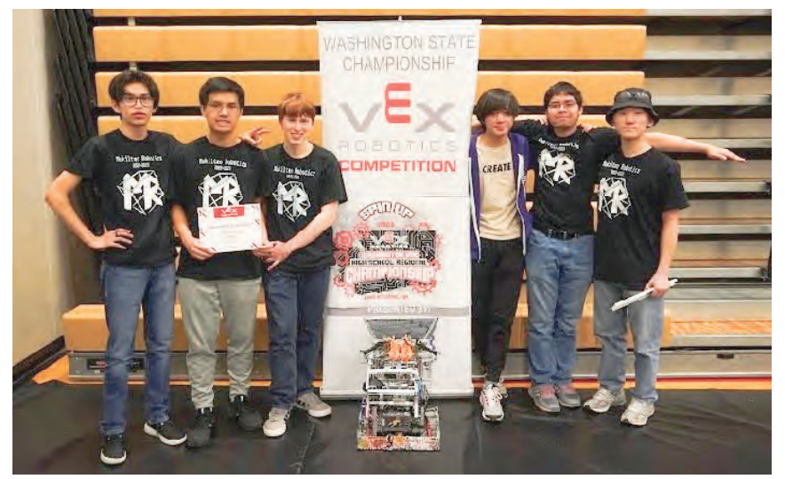
Members of Team Modulo of the Mukilteo Robotics Club who are heading to Dallas, Texas, to vie for the World Championship title at VEX Robotics Competition in April.