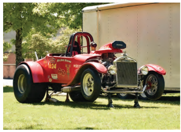
Meadowdale High School's Community Car Show and Vendor's Market. Lynnwood Times | Mario Lotmore.