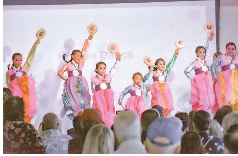
Asian Service Center cultural performance by Korean dance group Morning Star.