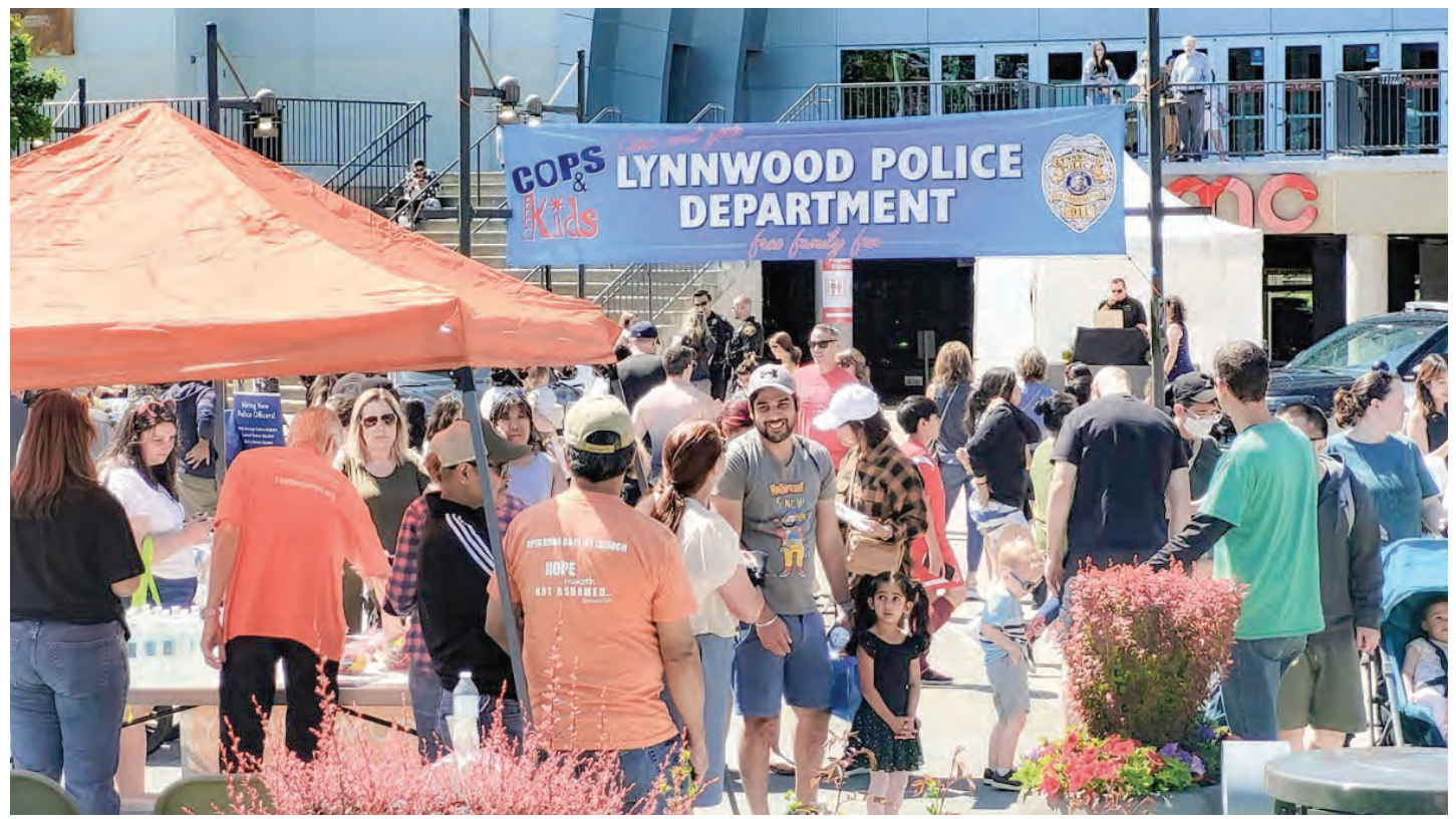
Lynnwood Police Department's 2023 Cops and Kids event that took place at Alderwood Mall Plaza on June 3, 2023.

Kids had the opportunity to engage in various activities, such as showand-tell sessions with different police vehicles, exploring the armory vehicle, lifting fingerprints, learning about