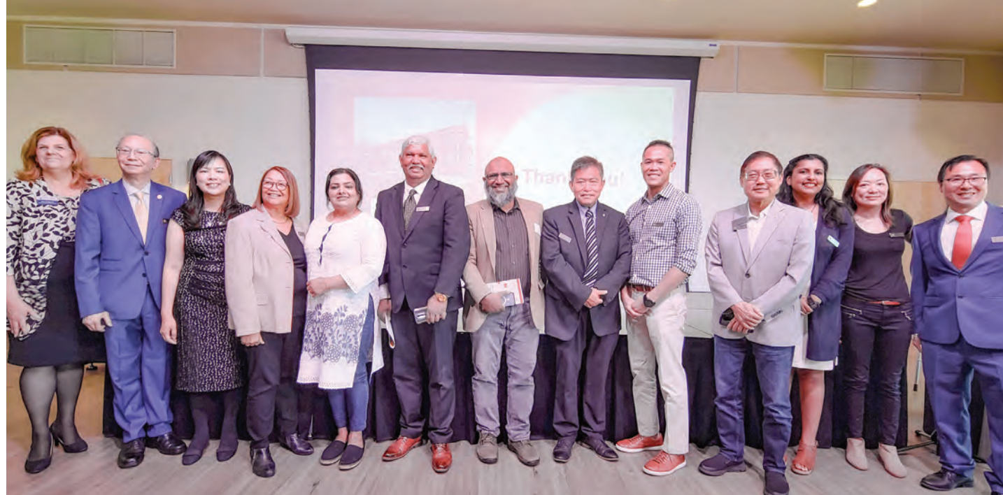
Edmonds-based Asian Service Center Board of Directors and Advisors during the inaugural ceremony at Edmonds Waterfront Center on June 3, 2023.