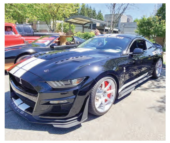
Winning vehicle of Best in Show at Meadowdale High School's Car Show.