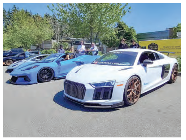
Winner of Best Classic and Best Import at Meadowdale High School's Car Show. Lynnwood Times.