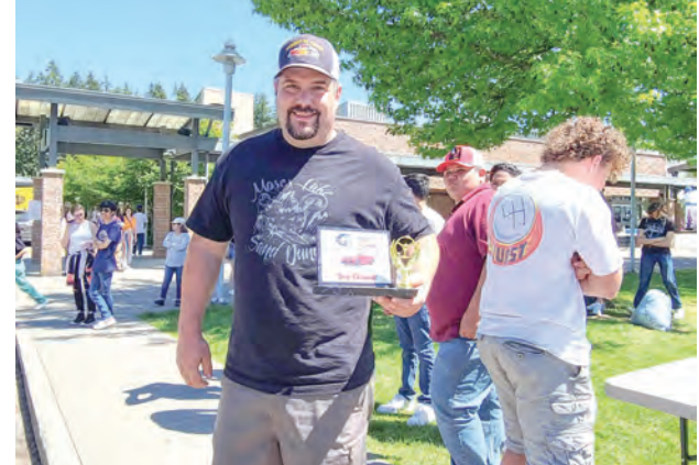
Winner of Best Exhaust at Meadowdale High School's Car Show. Lynnwood Times.