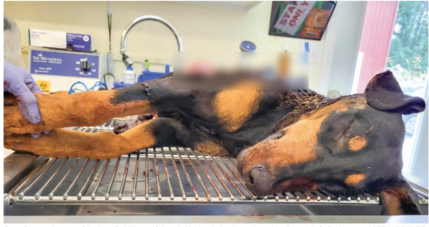
One of many pictures of the horrific killings of dogs in Yakima being investigated by Pasado's Safe Haven and PETA.

A private investigator for Pasado's working on the dog abuse cases, who asked to remain anonymous because she often works undercover, told the Lynnwood Times that Yakima County has had a history of dog killings, and animal neglect, for years. She suspects