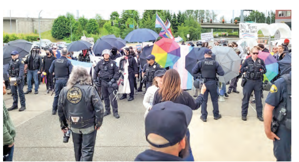
Dual Pro Olympus Spa and Pro-Trans rallies at the Lynnwood Event Center on June 17, 2023.