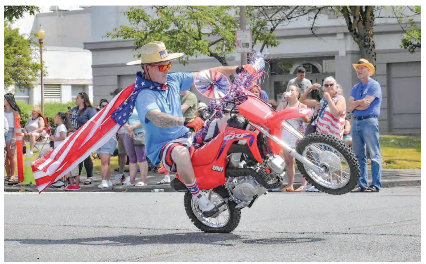
Fourth of July Parade in Downtown Everett on Juy 4, 2023.