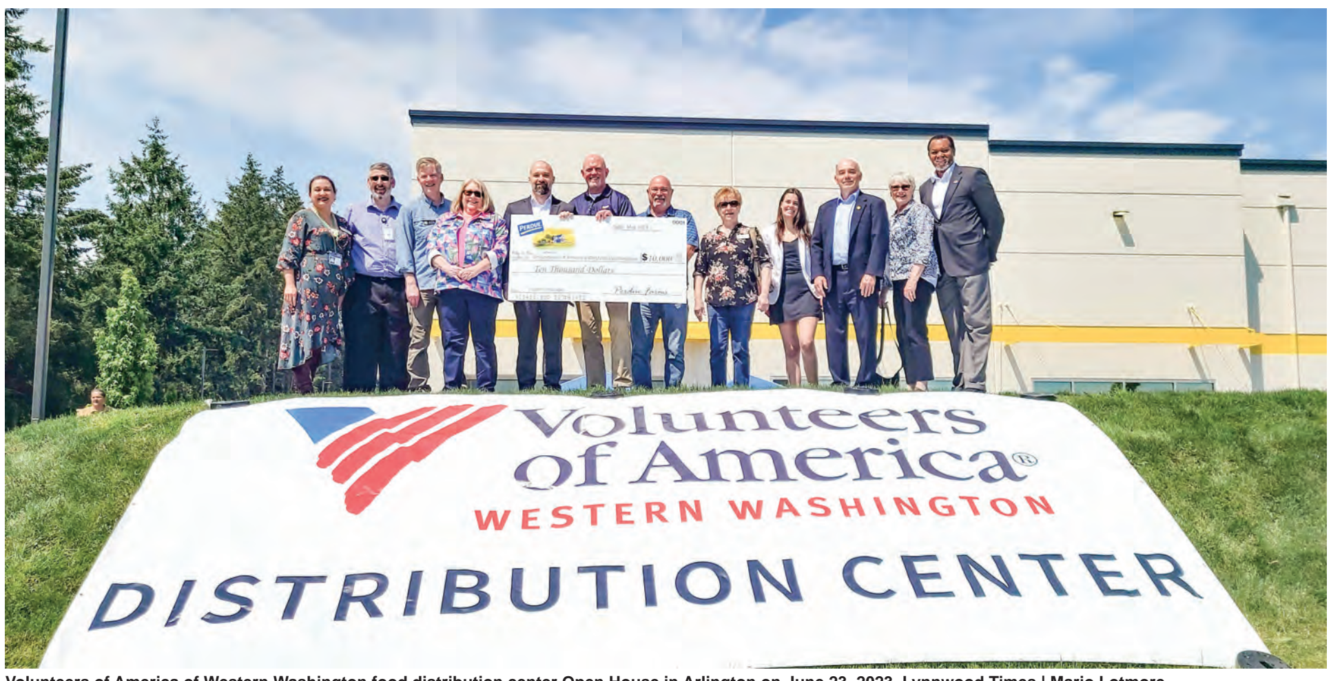
Volunteers of America of Western Washington food distribution center Open House in Arlington on June 23, 2023.