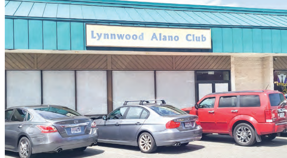
Front entrance of Lynnwood Alano Club.

"There's no retail space ningham. "We're trying