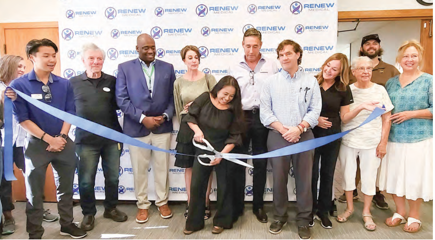
Renew Medical ribbon cutting ceremony on August 17, 2023.