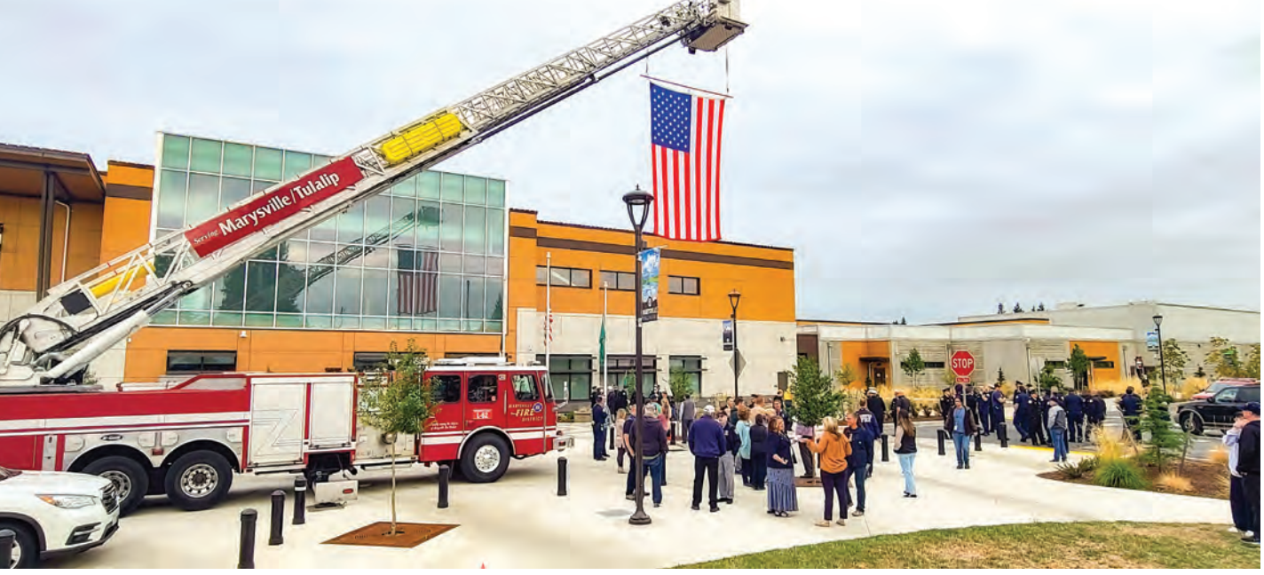
Marysville September 11 ceremony at its Civic Center on September 11, 2023.

Marysville residents, city staff, and first responders gathered Monday to re-