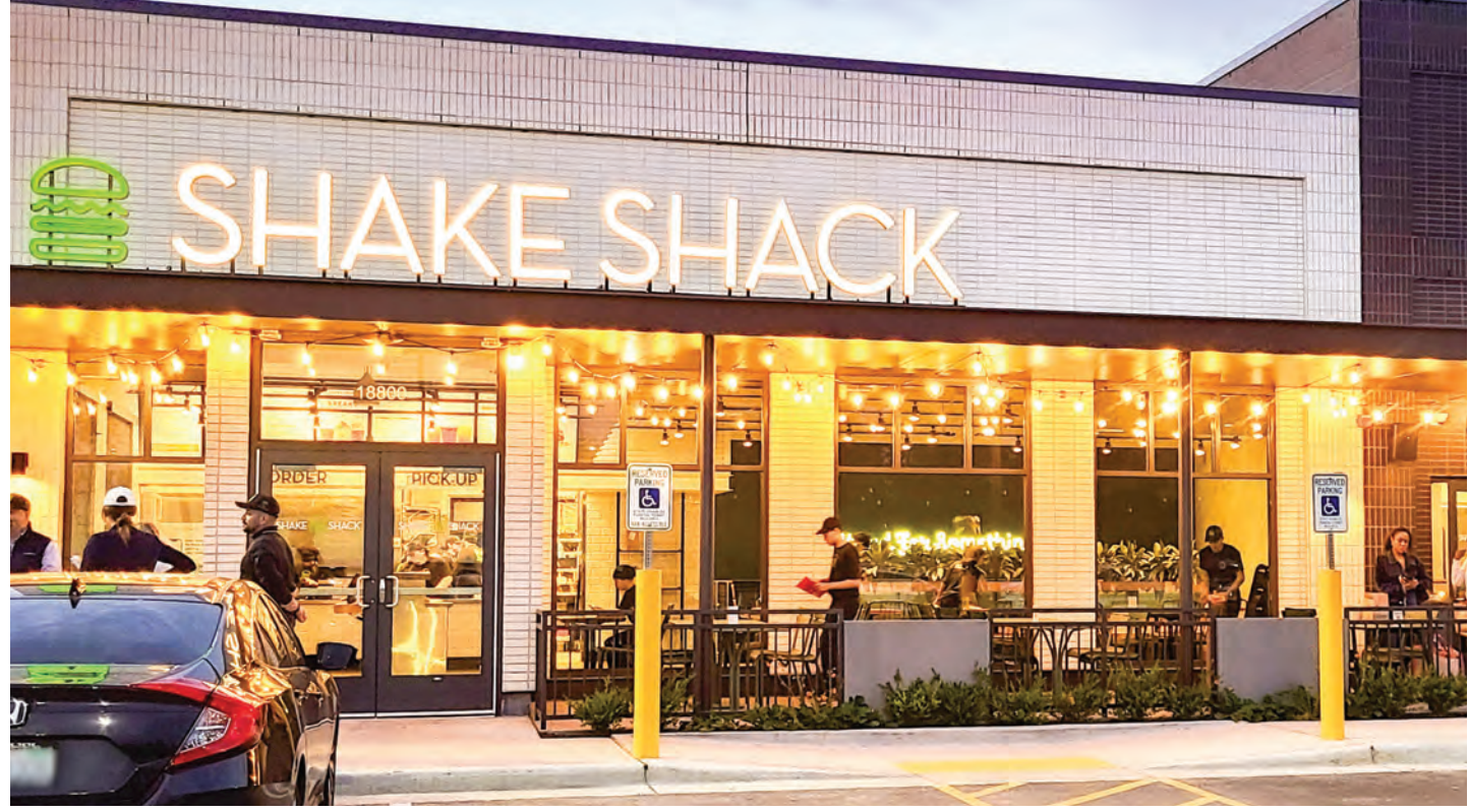
Shake Shack Lynnwood location at Alderwood Mall.

Wochnick noted the restaurant aims for a 7-minute wait time in the Drive