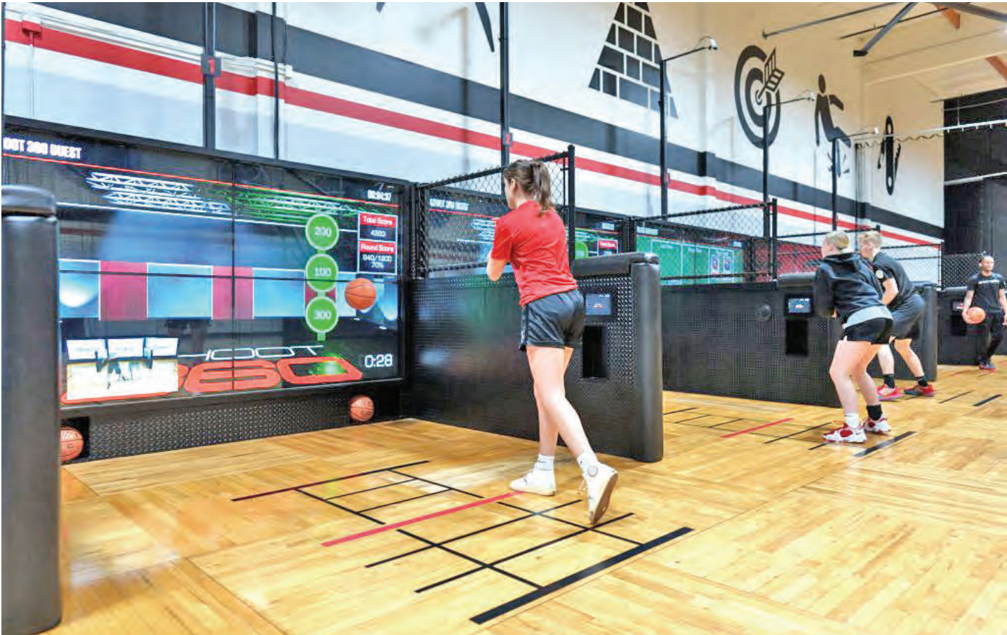
Example of Shoot 360’s gamified technology.