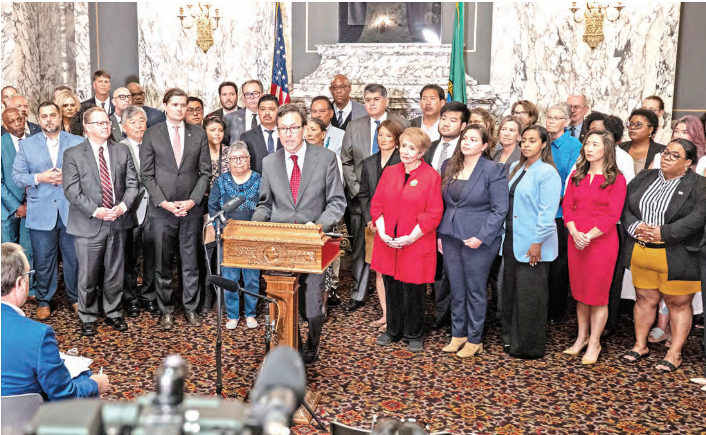
Joined at the state Capitol by legislators and members from numerous organizations, Gov. Bob Ferguson responded on Aug. 19 to a letter from U.S. Attorney General Pam Bondi over sanctuary policies.

Bondi’s letter to Ferguson specifically identifies Washington state as engaging in sanctuary policies and practices that thwart federal immigration enforcement efforts, demanding a response by Au-