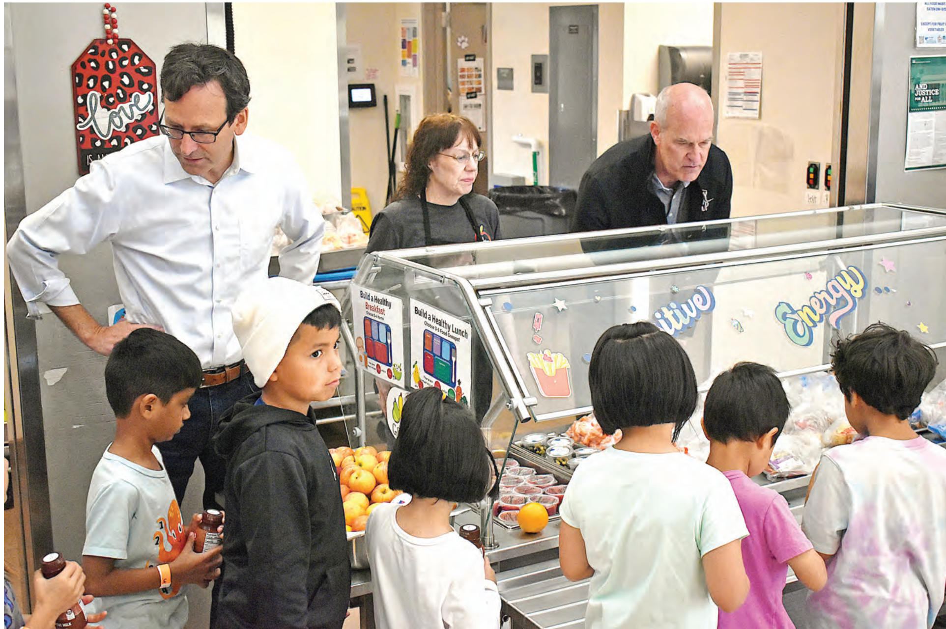
Representative Rick Larsen (WA-02) and Governor Bob Ferguson (right) serving bagged lunches to kids at Lynnwood Elementary School on Thursday, August 21, 2025, to highlight the risks of federal cuts to food and nutrition programs in Washington state. Followed by the opportunity to meet one-on-one with kids, they hosted a listening session with Edmonds School District staff, local nonprofits and families.